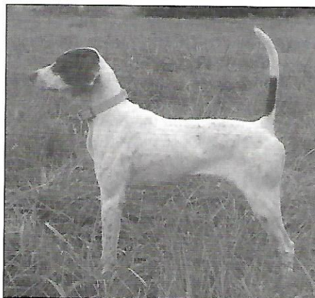
CHISLED IN STONE First in the Amateur Derby