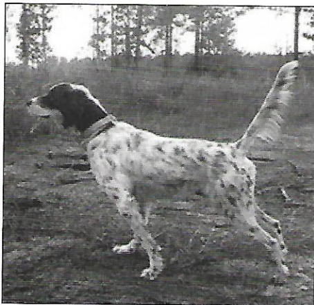
PEACE DALE SCOOTER Second in the Gerald Tracy Memorial Amateur Shooting Dog Stake