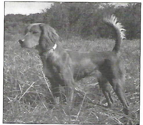
REDSTONE First in the Open Restricted Shooting Dog Stake