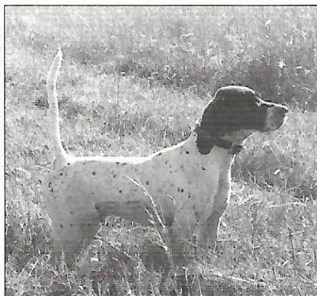
CASEY CREEK REMOTE CONTROL First in the Open Shooting Dog Stake; First in the Amateur Shooting Dog Stake