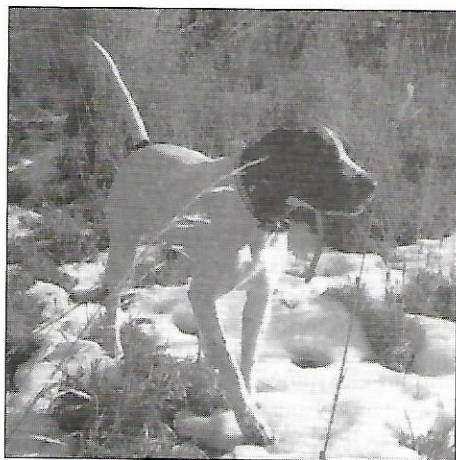
RAILWAY PEPSI Second in the Open All-Age Stake