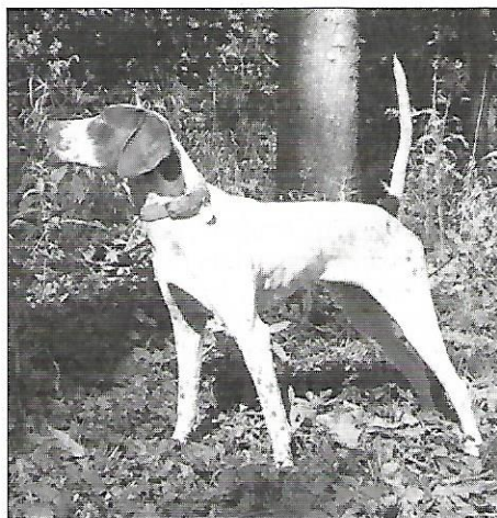
RELOADED First in the Open Derby