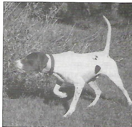
PEPSI POLO First in the Open Derby