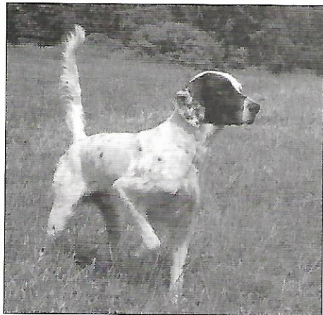
THOMAS ADIRONDACK RINGO Second in the Amateur Shooting Dog Stake