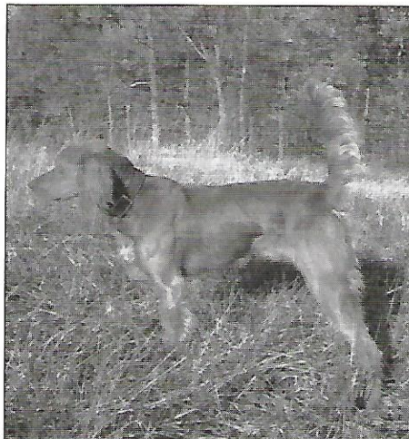
JUSTIFIED Second in the Amateur Derby