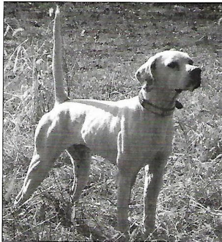
GREAT RIVER ICE First in the Open Shooting Dog Stake