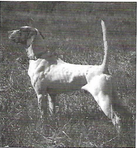
OUR BIG BULLY Second in the Open Shooting Dog Stake