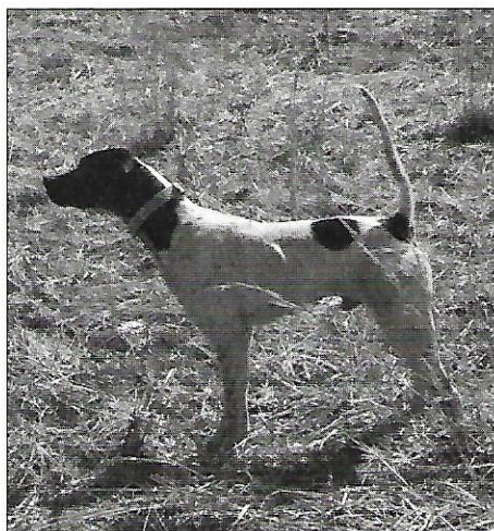
WESTFALL'S BLACK CLOUD Winner of the Region 17 Amateur Shooting Dog Championship