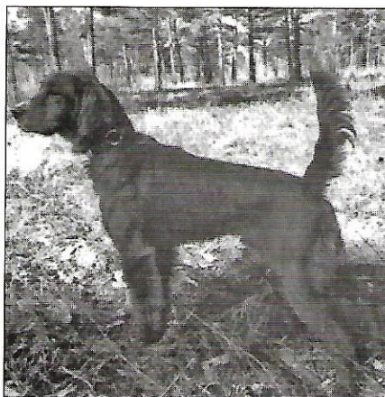
BREAKSTONE Second in the Sawtooth Amateur Shooting Dog Classic

Long Shot had four evenly spaced finds and an exceptional forward race in weather where the change in tempera-