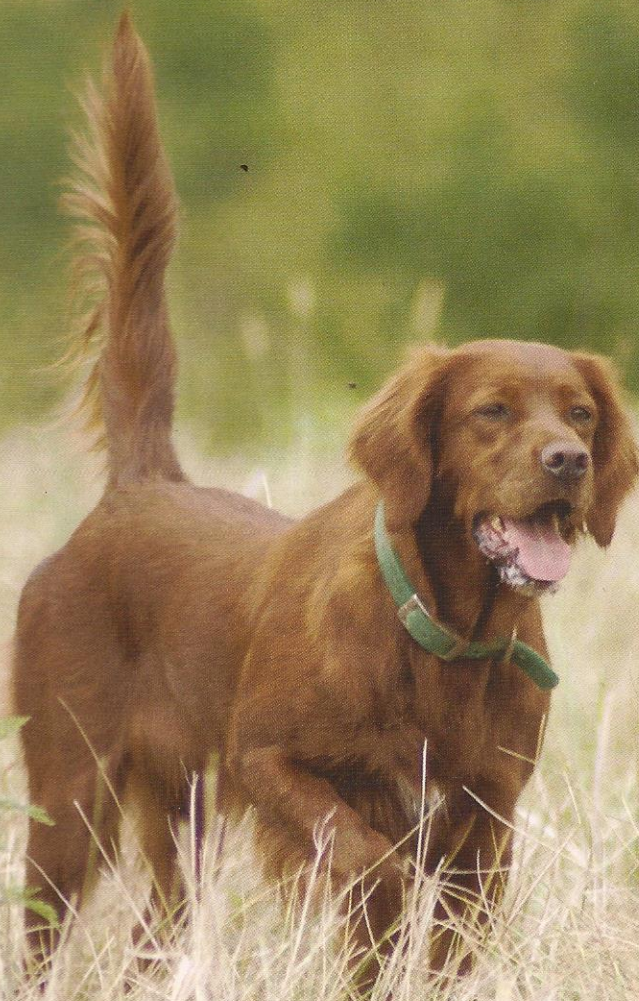
Aoife O'Daoine Sidh Irish Setter

A Publication of The North American Versatile Hunting Dog Association • Volume XLVI • No. 1 • January 2015