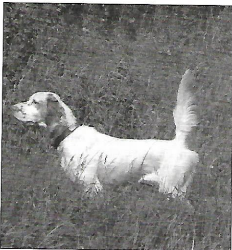
HOMEWARD PEGGEY Second in the Amateur Derby