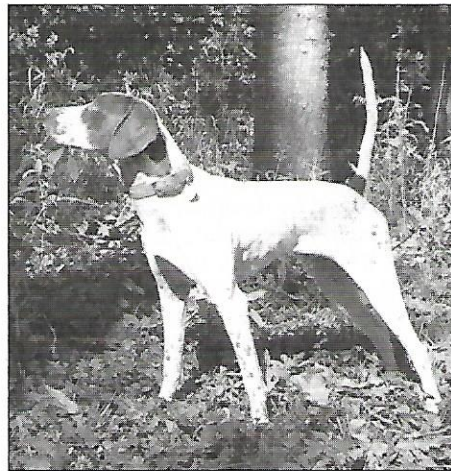
RELOADED First in the Open Derby