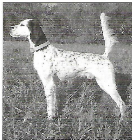
GRAND HERITAGE MOTION First in the Open Shooting Dog Stake