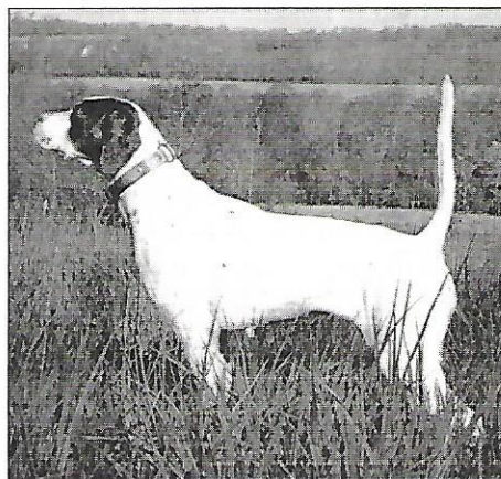
ANNABULL First in the Amateur Shooting Dog Stake