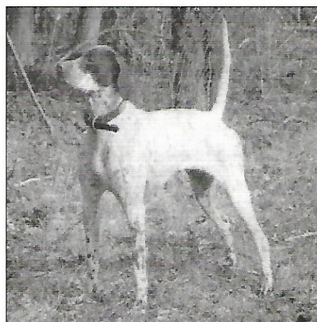
REDGATE'S SASSY PANTS Third in the Open Derby