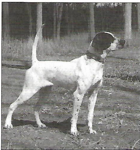
ERIN'S DANCING QUEEN First in the Beaver Creek Open Shooting Dog Classic

and handlers and compete all around the Southeast. Thanks for a job well done.