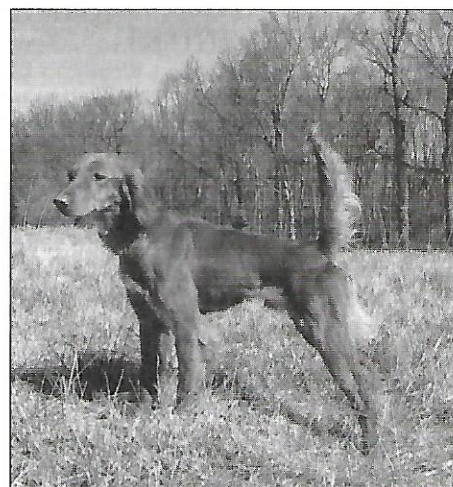
RENDITION First in the Amateur Derby