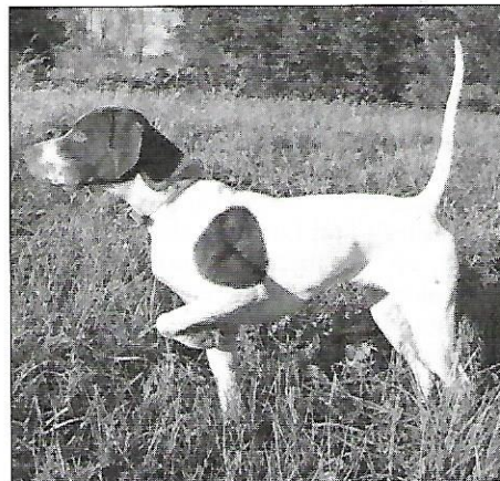
TRIPLE G DOMINATOR'S GIRL Second in the Keystone Open Derby Classic

The Thrill Is Back had three finds and an unproductive. Avalon Creek had a back and then an absence. Maple Valley Cowgirl had a find and then a long absence. Great River Razor had a back and then was up. Calico's Dyno Mite racked up five finds and finished. Bracemate White Spider erred early.