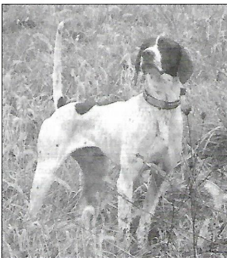
ERIN'S BOXCAR WILLIE Second in the Keystone Open Shooting Dog Classic