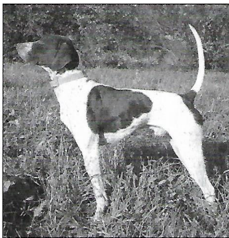
DOMINATOR'S LEGACY First in the Keystone Open Derby Classic

Misty Acres Abby had a find but did not finish. Octavio had four finds and finished. Great River Dominator had three finds and an unproductive. Heritage had four finds. Both finished.