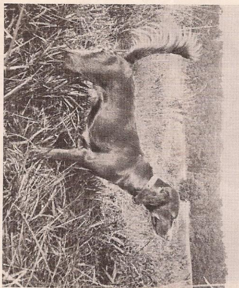
POLLYWOG Runner-up in the National Red Setter Championship

As is the case with any other national breed club, the NRSFTC's membership is scattered around the country, and most of the members don't get a chance to see one another at any other time of the year, so this is an opportunity to renew old friendships and start new ones.