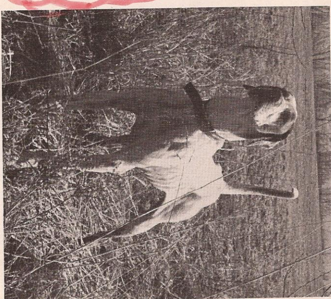
HUNTING HILLS COWBOY Second in the Open Shooting Dog Stake