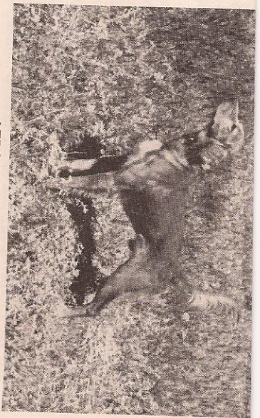
AEROWIND'S CHIPPER Second in the Amateur Shooting Dog Stake