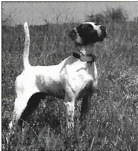
BARCELONA BULL Second in the Amateur Shooting Dog Stake