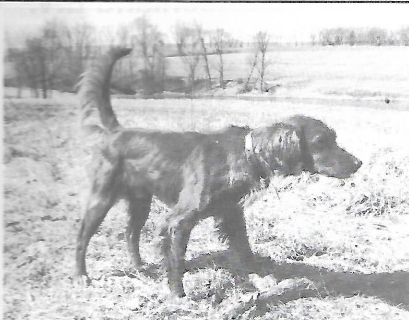
3 x Ch. Come Back Fireboy (25-14-79)