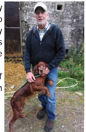
An O'Sullivan Lad!