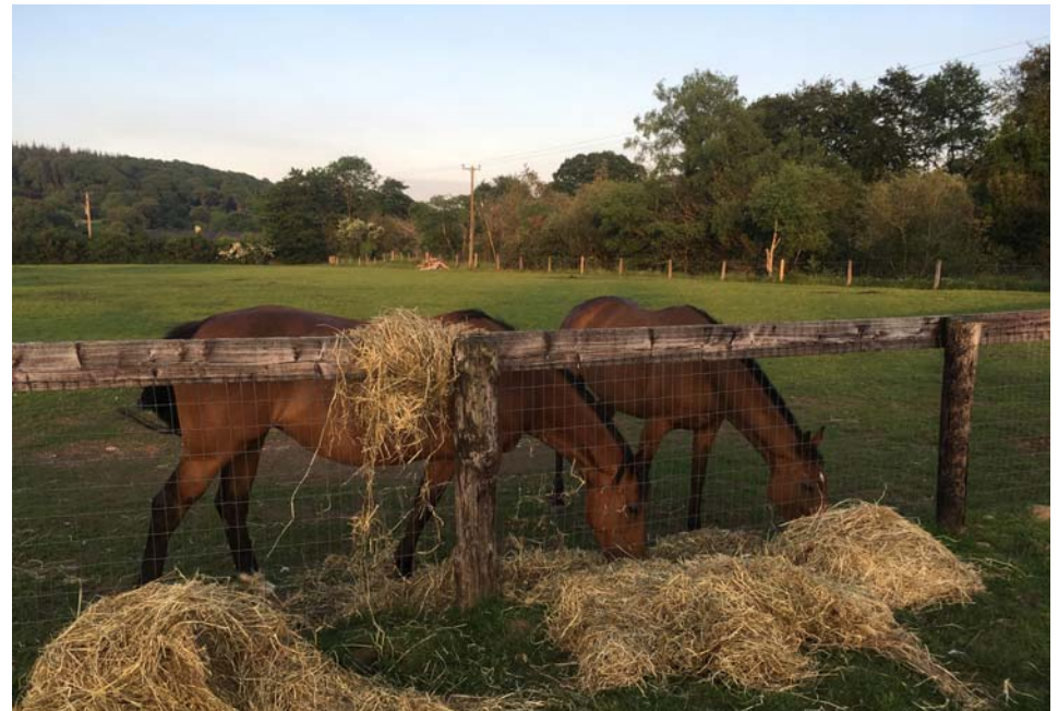
The horses paid us little interest; they were busy enjoying rich hay. The Deak's have a full finished arena where Laura can work with the horses and practice jumping, dressage and more!