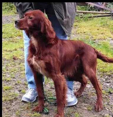
Dog in Ireland

One place where you DO see a physical difference is in the tail carriage. Our dogs are bred to have a high twelve o'clock tail. (Hopefully, the tails are straight without a sickle effect.) The dogs in Ireland are bred with horizontal "pump handle" tails. How the dogs perform in trials in each country, and how they "carry themselves" is mandated by a written standard. The following is the working dog standard from Ireland. I'll include a photo here to show you what dogs are expected to look like as they hunt for game.