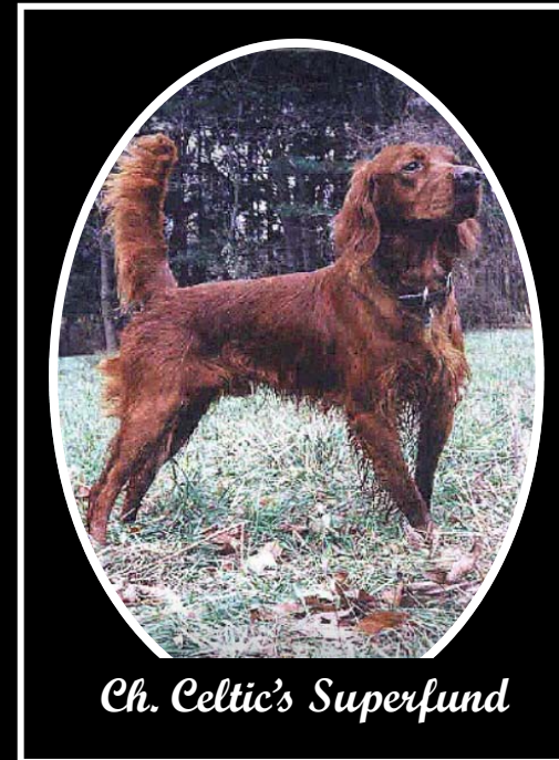
Ch. Celtic's Superfund

Established in 2007 to provide for educational, scientific, literary, and charitable opportunities for The National Red Setter Field Trial Club as our members continue their pursuit of the "Purest Challenge in Sportsdom..."