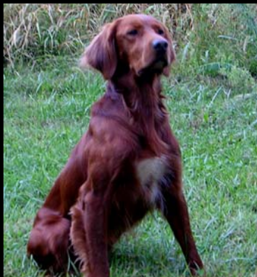
Dog in USA

If you look at the dogs in Ireland and they are simply sitting in a field or playing in a kennel, they look very much like our dogs here in the states. Here's an example of each: