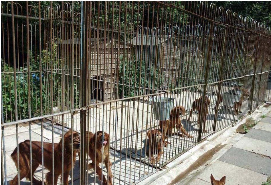
The older dogs are in the photo above— the entire place is exceptionally clean with plenty of room for the dogs to socialize and play. The photo below is a close up of his young pups— beautiful dogs in a lovely environment