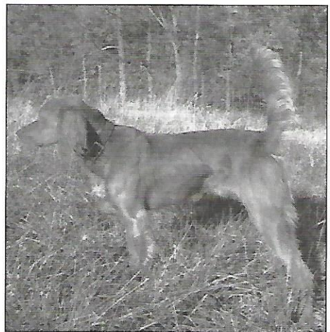
JUSTIFIED First in the Open Derby

Berken of the Snows (Norton) and Aiken (Beauchamp) were turned loose heading up the hill into little vine loop. Aiken was absent by the time the course