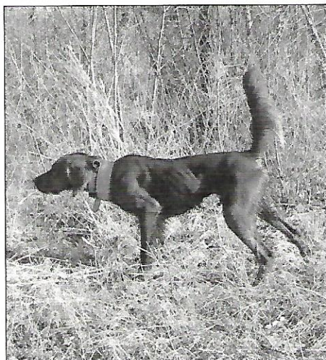
COME BACK AUDIE Second in the Open Shooting Dog Stake