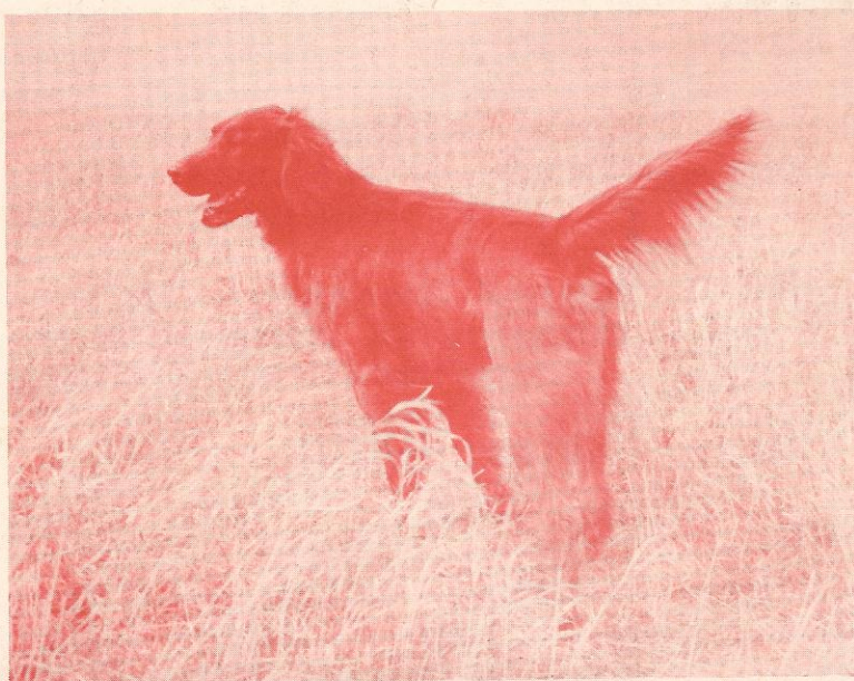
————— "AUTUMN HILLS DUKE" —————