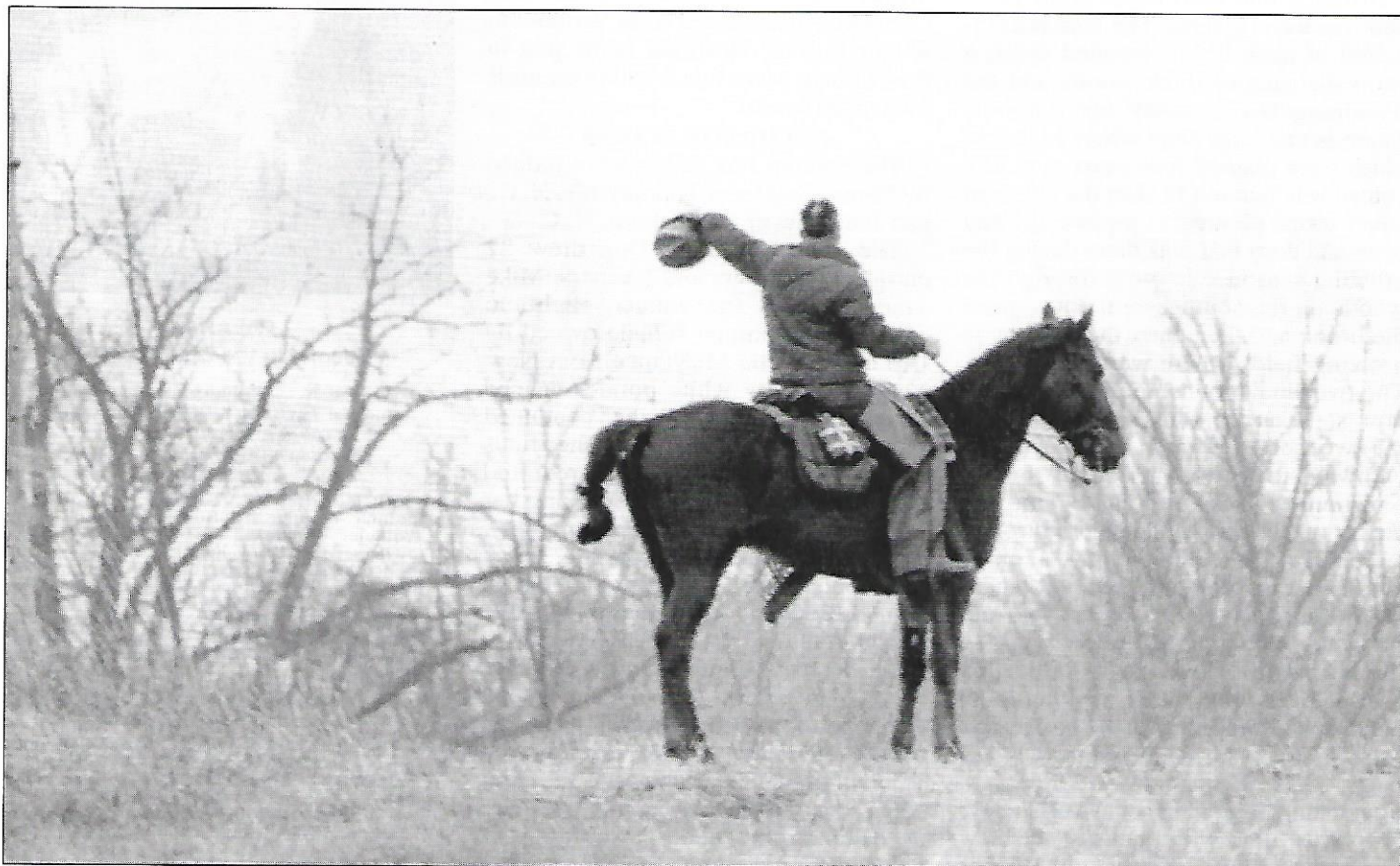
Point! National Championship, Ames Plantation, 1976.