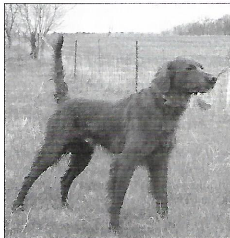
BROPHY'S SANDCREEK JOHN GALT First in the Open Restricted Shooting Dog Stake