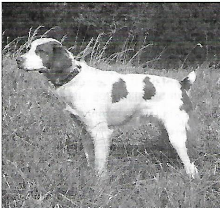
T M'S TENNESSEE TWISTER First in the Open All-Age Stake