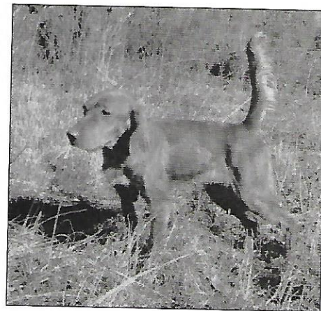
NANTUCKET Second in the Amateur Derby