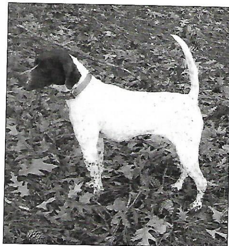
DIVIDING CREEK HAPPY First in the Amateur Shooting Dog Stake

Northern Neck would like to thank all who participated and helped in any way