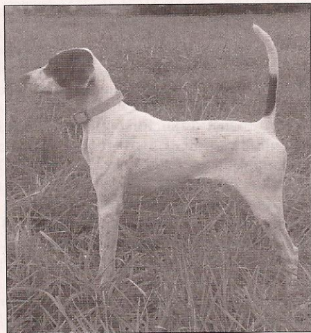
CHISLED IN STONE First in the Open Derby